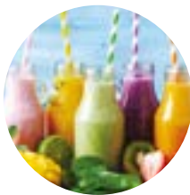
Beverages (i.e. fruit-flavored milk drink)